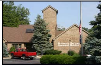
City of Crescent Springs

We were recently appointed City Engineer for Crescent Springs. We are excited to work with the neighborhoods and people that make up this great suburban community. In addition, the Engineering Department has