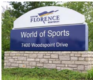
World of Sports Entrance Monument

The City of Florence and Northern Kentucky University's Center for Applied Ecology have teamed up to take on a stream restoration project at the World of Sports Golf Course. The lake, which can be seen from I-71/75, has become a maintenance problem for the City and the existing dam is in need of substantial repairs.