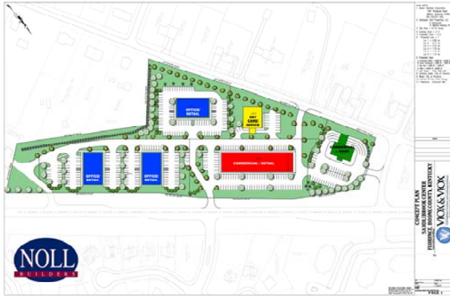
Saddlebrook Center Concept Plan

Recently, Boone County Planning Commission unanimously approved a zone change for a new commercial center on Weaver Road in Florence, Kentucky. The developer, Noll Properties, is currently waiting for final approval from the City of Florence.