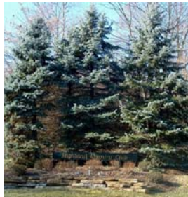
Top: Entrance to Steeplechase Bottom: Entrance to Highland Country Club