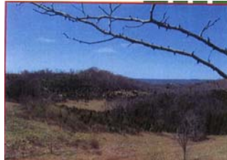
View from Entry into Arcadia