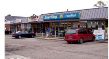
Ameristop shopping center on Erlanger Road (Viox & Viox office expansion located on far left side of center)

hour requirements for licensure and/or certifications. The conferences also provided our professionals with a general awareness of current issues and new innovations. The conferences included the American Water Works Association Conference in San Antonio, Texas, the Ohio-Kentucky-Indiana Regional Planning Conference in Cincinnati, Ohio, and the American Society of Landscape Architects Conference in Minneapolis, Minnesota.