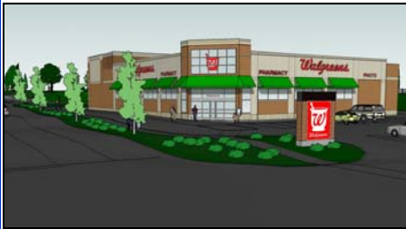
3-D Conceptual Model of Walgreens to be located on Kyles Lane and Dixie Highway

There will soon be more Walgreens stores for Northern Kentucky customers. Viox & Viox has worked with Anchor Properties to secure zone changes to allow new stores on Dixie Highway in Ft. Wright and on