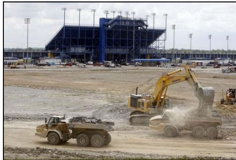
Construction continues at Kentucky Speedway

The Phase I construction included 1.5 million cubic yards of earthwork, of which approximately 900,000 cubic yards was solid rock. The