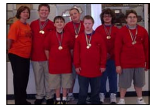
Members of the Erlanger/Elsmere Recycling Team show off their Special Olympic medals

Finally, congratulations to the members of the Erlanger/Elsmere Recycling Team who recently participated in the Special Olympics. The Recycling Team, made up of students from Tichenor Middle and Lloyd High, faithfully retrieve Viox & Viox's used paper products each week as a fundraiser for their schools.