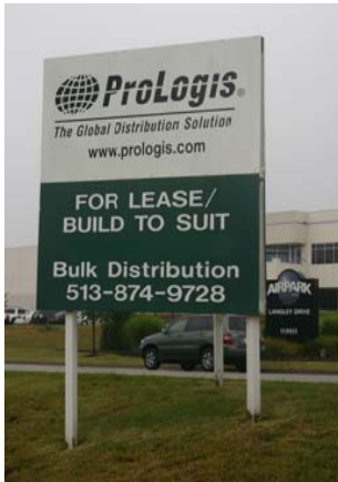
New sign located at Airpark West, Park 275 in Hebron

Prologis is continuing their business relationship with Paul Hemmer Construction Company by developing property in Hebron, purchased from Hemmer, which will include a building of nearly 740,000 square feet. The building, which will be the size of approximately 11 football fields, is located in Airpark West, Prologis Park 275, off of KY 237 and Langley Drive.