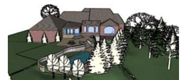
Recent landscaping project using 3D software

will not only be useful for the client, but will be an important visual aid for public hearings.