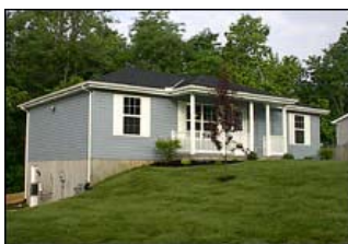
Habitat for Humanity House; Latonia Lakes