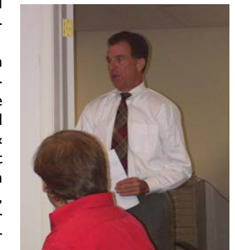
Viox & Viox staff met new business consultant at a recent luncheon.

Though change can be difficult while an organization is redefining itself, we are looking forward to the end result. For sixty years Viox & Viox has delivered excellent service to its clients. Through the steps we are taking now, we hope to continue to deliver excellent service for another sixty years and beyond.