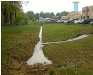
Top: Erosion of New Uri Creek; Bottom: Detention facility near Florence Elementary School