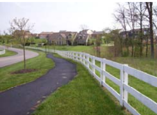
Top: Abby's Florence location; Bottom: Site of new Abby's on Grand National Blvd. (facility to be situated in area to the right of fence)