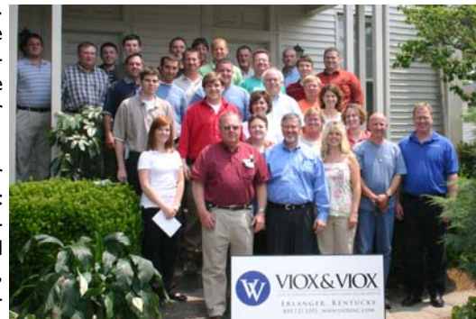
Viox & Viox Staff 2007