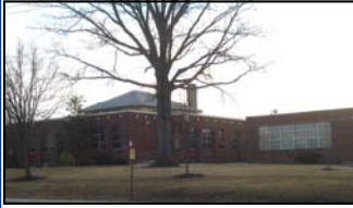
Samuel Woodfill Elementary School in Fort Thomas was originally constructed in the 1920s.

The existing Samuel Woodfill Elementary School at the corner of Alexandria Pike and South Ft. Thomas Avenue in Fort Thomas was built in three phases. The original building was constructed in the 1920s and additions were added in the 1950s and 1970s. The school is currently using a portable trailer as additional classroom space.