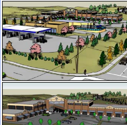
Below: View of Centre of Erlanger from intersection of Houston and Donaldson Roads; Centre of Erlanger Retail Complex

Viox & Viox is currently designing the grading, paving, storm water and miscellaneous utilities while Hayes and Associates have been completing their architectural sketches. Construction on Phase I, Part I will begin in the spring.