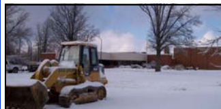
Below: Demolition begins soon at former Florence YMCA site; Architectural rendering of Ethos @ Main Street by Tucker, Booker, Donhoff of Louisville, KY