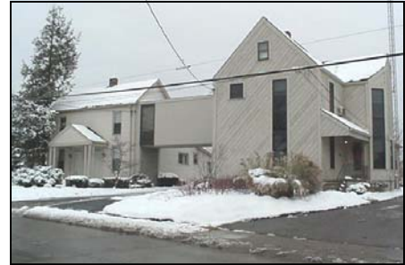
Snowy winter day at Viox & Viox