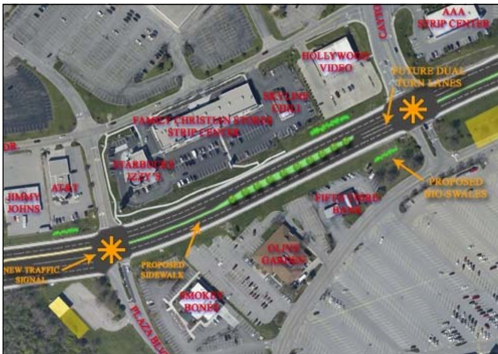
Portion of the Mall Road Concept Plan (from Plaza Boulevard to Cayton Road). Plan shows improved landscaping, new sidewalks, and improved signalization.

This project is being funded by the Commonwealth of Kentucky Transportation Cabinet Department of Highways and the City of Florence. The funds are made possible by the 2009 Kentucky General Assembly House Bill 330.