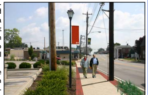
Conceptual photograph of Dixie Highway streetscape improvements in area south of Graves Ave. intersection

Funding for Phase two has been applied for through the City of Erlanger. Phase two will include the area between Graves Avenue north to the railroad overpass in Erlanger.